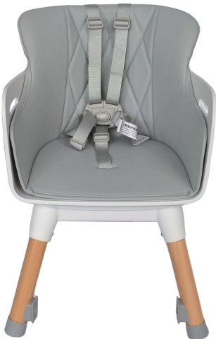
Lo Chair mode

Suitable for children who are able to sit up unaided and up to 3 years of age or a maximum weight of 15 kg.