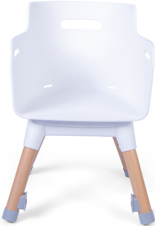
Infant Chair mode

Suitable for children who are able to sit up unaided and up to 3 years of age or a maximum weight of 15 kg.